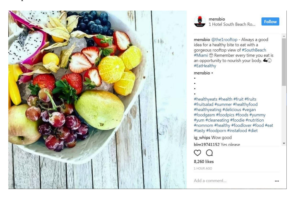
Figure 3. Fruit Bowl Top Post

Images of clean foods are situated within wider foodscapes, juxtaposed to the proliferation of rich and gluttonous food imagery found in advertising and televisual media that provide a substitute source of pleasure (Spence et al. 2016: 55). For example, in one post a collection and assortment of fruits are prepared and presented in a bowl.