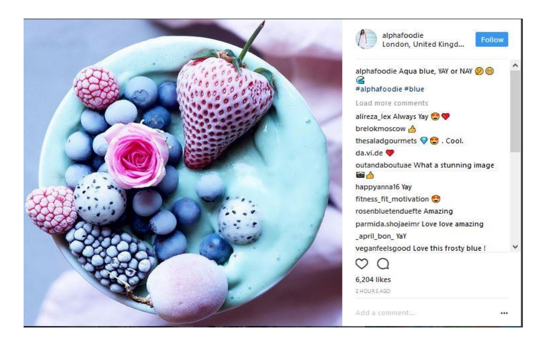
Figure 8. Aqua Blue Smoothie