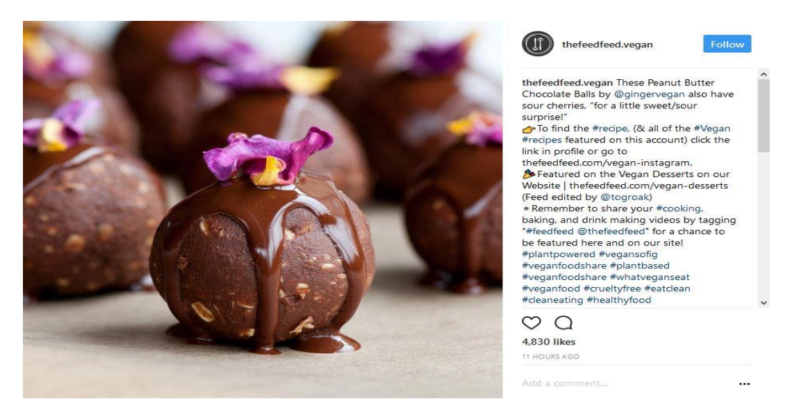
Figure 5. Vegan Peanut Butter Chocolate Balls.

While purity is found perhaps most unadulterated in our first top post, in figure 2 we see another motif associated with clean eating posts: the literal incorporation of defiled elements (or at least those perceived as such). As Mary Douglas informs us, notions of purity work as a signification through a relationship with the defiled (Douglas 1966: 35). Instances of clean eating subvert the literal symbolic presentation of clean foods that simply appear "clean" and "pure" by inclusion of paradoxical aspects that visually draw on notions of the unclean through their emulation of indulgent foods, while retaining their health status by using "clean" ingredients. A sensory incongruity, therefore, is deployed to generate interest. This refers to the use of one modality, for example the visual components of food that become intentionally mismatched with another sensory modality, for example, taste (Spence & Piqueras-Fiszman 2014: 218). One example that drew more heavily on this technique was figure three: vegan peanut butter chocolate balls.