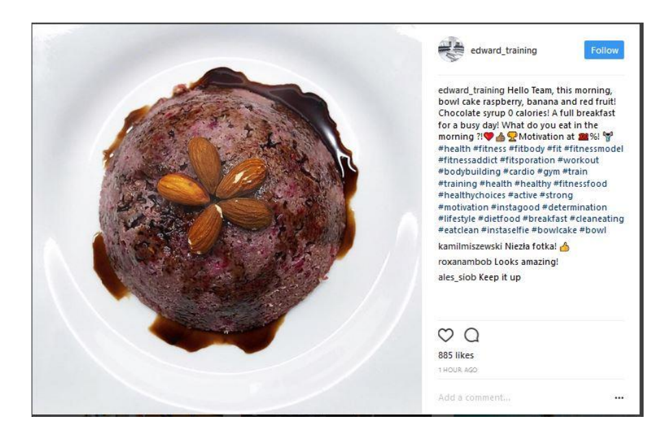
Figure 4. Raspberry and Banana Bowl Cake

While purity is found perhaps most unadulterated in our first top post, in figure 2 we see another motif associated with clean eating posts: the literal incorporation of defiled elements (or at least those perceived as such). As Mary Douglas informs us, notions of purity work as a signification through a relationship with the defiled (Douglas 1966: 35). Instances of clean eating subvert the literal symbolic presentation of clean foods that simply appear "clean" and "pure" by inclusion of paradoxical aspects that visually draw on notions of the unclean through their emulation of indulgent foods, while retaining their health status by using "clean" ingredients. A sensory incongruity, therefore, is deployed to generate interest. This refers to the use of one modality, for example the visual components of food that become intentionally mismatched with another sensory modality, for example, taste (Spence & Piqueras-Fiszman 2014: 218). One example that drew more heavily on this technique was figure three: vegan peanut butter chocolate balls.