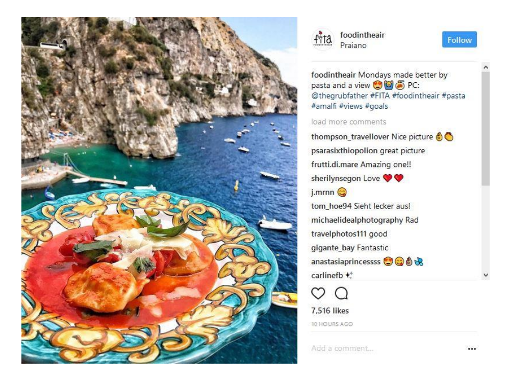
Figure 7. Food in the Air clean eating top post