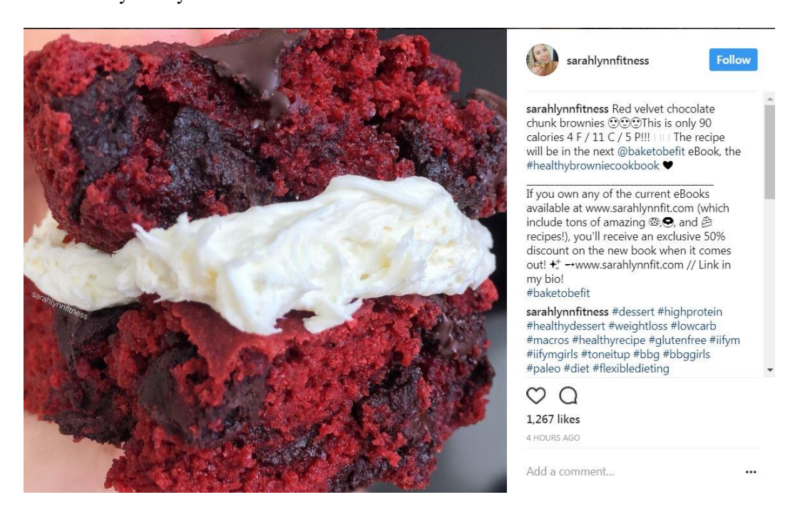
Figure 6. Red Velvet Chocolate Chunk Brownies

The incorporation of defiled elements represents a critical motif in food photography associated with clean eating top posts. An ever more jutting example was provided by a fitness blogger and displays a chocolate brownie with #healthydessert #lowcarb #healthyrecipe #weightloss. Again, appearing visually indulgent, negative connotations are negated by the recipe's "pure" ingredients and textual references to healthy lifestyles.